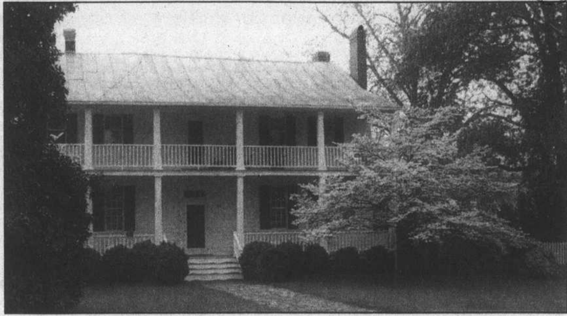
Strawberry Hill will be among the lovely homes open to the public during the Biennial Pilgrimage in Edenton this weekend.