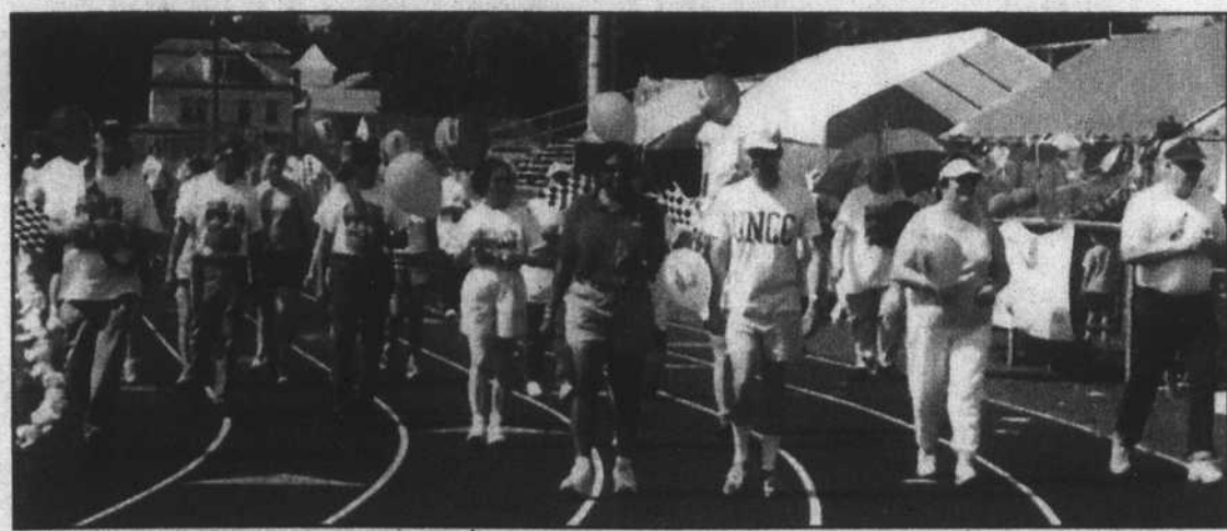
Residents of Chowan and Perquimans counties will join together this weekend at John A. Holmes High School in Edenton as they hold a joint American Cancer Society Relay for Life. Proceeds from the Relay, which raises thousands of dollars annually, will be used for cancer research.