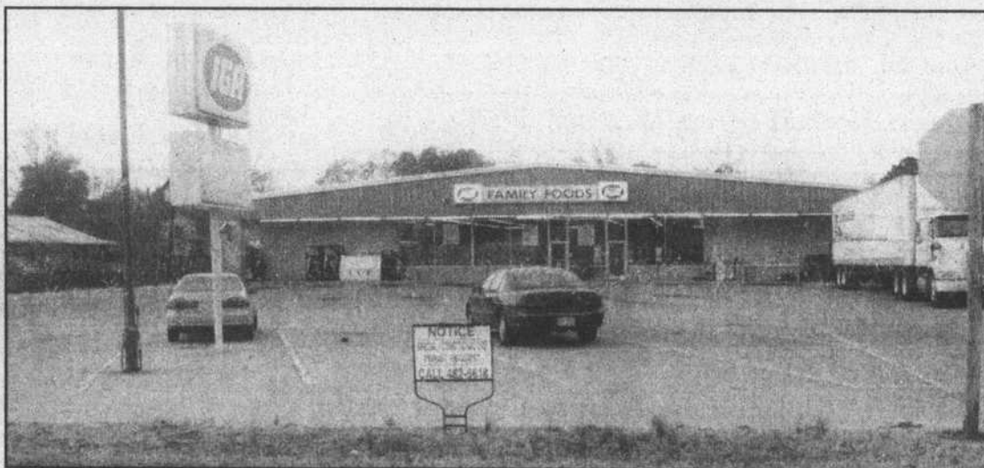
Edenton's IGA/Family Foods will close its doors for good on June 15. The store is closing to make way for a Dollar General.

"I would like to see it stay. It's convenient and they have good