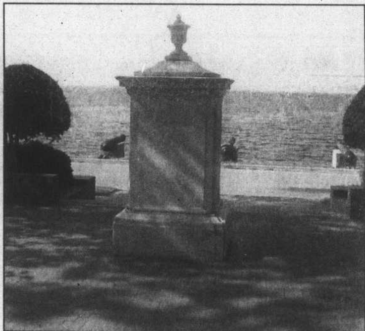
The Edenton Tea Party Chapter DAR will host a public ceremony at the site of the Joseph Hewes monument on the Edenton waterfront the morning of July 4. The organization sponsors the event each year in honor of Joseph Hewes, an Edenton patriot who was the only North Carolina representative present to sign the document on July 4, 1776 in Philadelphia, PA.

It is an important event because only 56 men signed the declaration and Hewes was one of them. These men put their lives on the line and