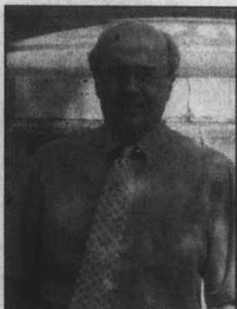
Mayor Roland Vaughn