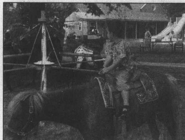
Pony rides will be among the attractions for youngsters at the July 4 celebration hosted this Friday by the Optimist Club.