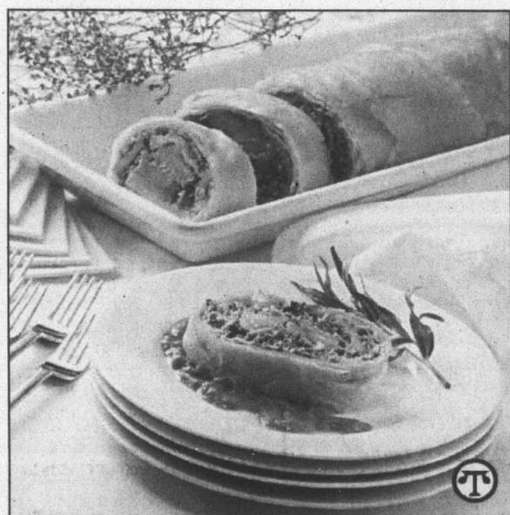
For dishes with true European flair, like Cambozola Strudel (above), try adding some ingredients imported from Germany.

jellyroll fashion; place seam-side down on pan and brush with remaining melted butter. Bake 20-25 minutes or until golden brown.