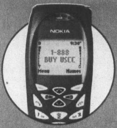
Nokia® 3585 for $19.95 (after $30 mail-in rebate)

Multi-state regional calling plans also available.