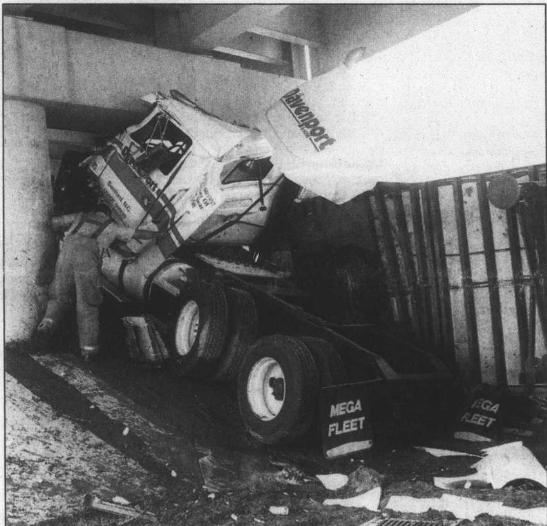
Last Thursday afternoon this 18-wheeler operated by a Sanford, NC truck driver was driven off the Hwy. 17 overpass when the driver fell asleep at the wheel. The truck struck the guardrail and continued off the overpass, crashing onto Hwy. 32 below. The truck landed on its side, blocking most of the traffic on the highway. The driver was treated for facial injuries and released the following day.