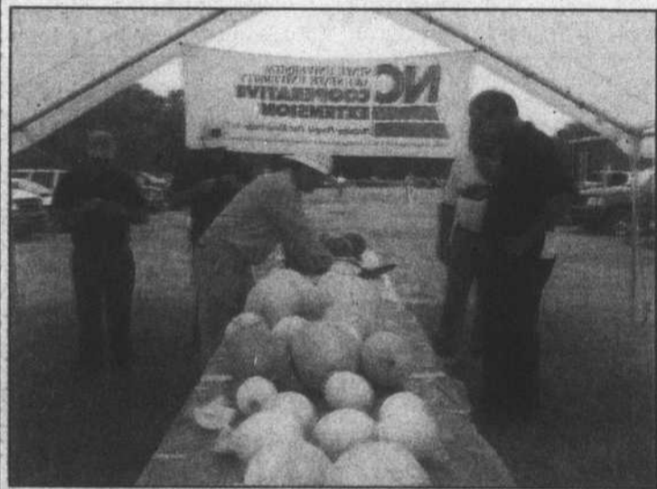
More than 100 researchers and farmers had the opportunity to sample specialty melons from the Chowan County region.

management. Farmers in attendance asked questions related to their own crop issues.