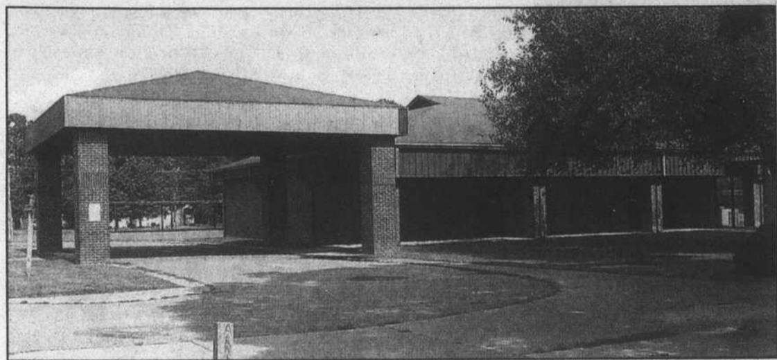
East Edenton voters will now cast their ballots at the old D.F. Walker School (see photos above) at the Edenton High/D.F. Walker Alumni Building, 824 North Oakum Street, Edenton.