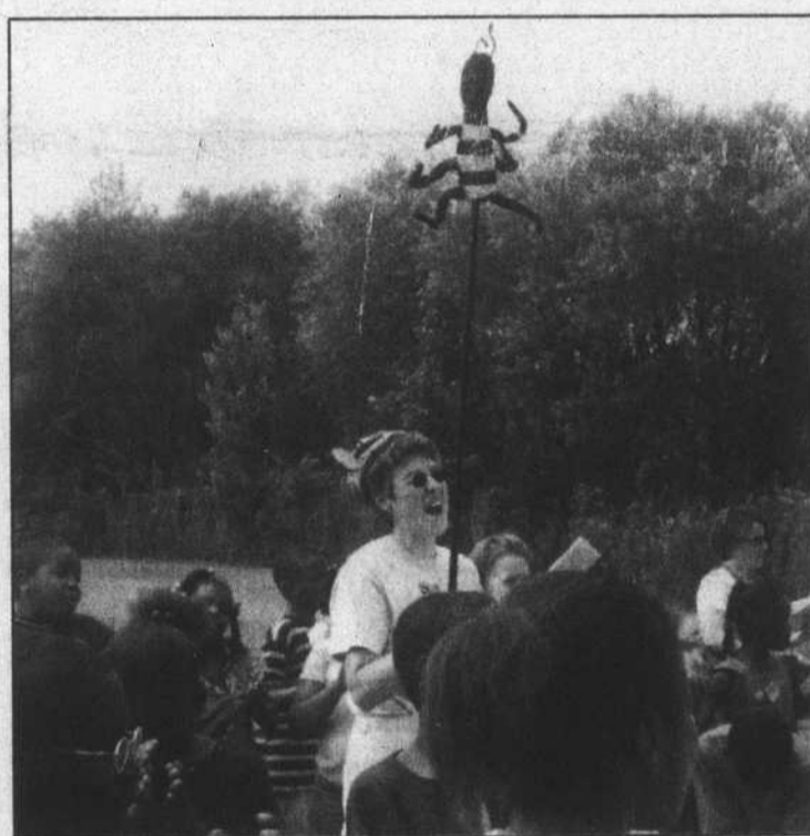
Walker staff and students celebrate their success