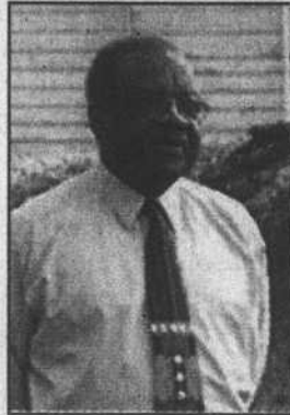
REP. FRANK BALLANCE

fight to maintain the integrity of their community and I will continue to support them in every way possible as this decision goes forward."