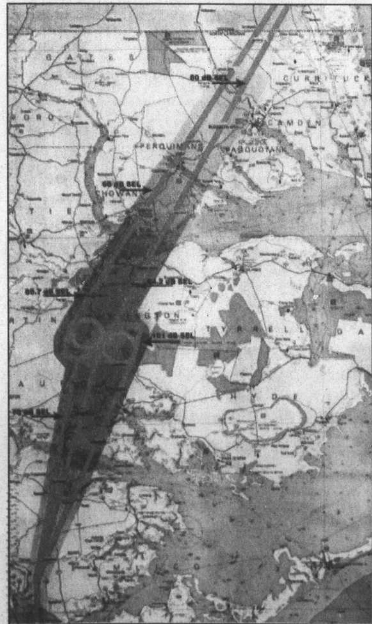
This map shows the projected jet noise impact path to and from the Navy's proposed OLF site.

Also after Oct. 28, residents may continue to take tree limbs and other hurricane-related debris to the county's waste disposal convenience centers at no charge.