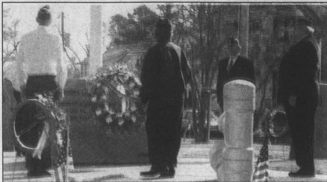
American Legion Post 40 Honor Guard lays service wreaths during the annual ceremony at the Chowan County Veterans Memorial in Edenton.