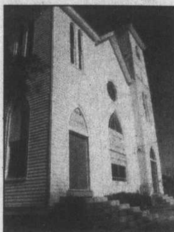
The historic Kadesh AME Zion Church in Edenton sustained heavy damage during Hurricane Isabel. Church officials estimate it could be years before all the damage is repaired.