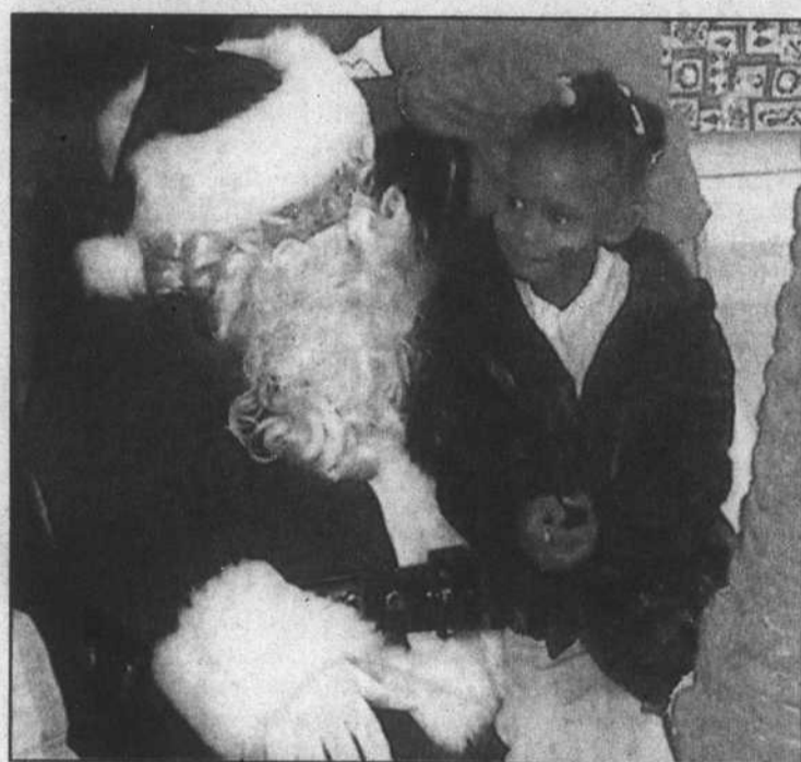
Old Saint Nick listens to one little girl's Christmas wishes during the Operation Santa party.