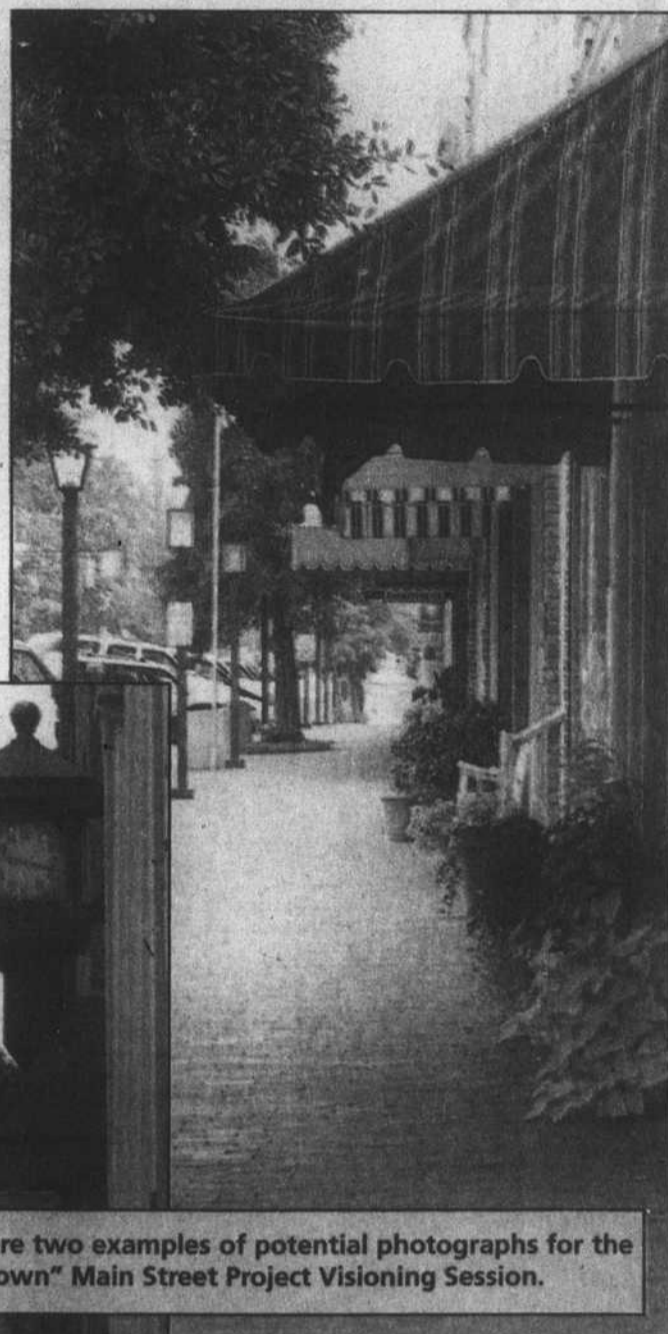
Shown here are two examples of potential photographs for the "Picture Downtown" Main Street Project Visioning Session.

"Our goals come from community input. I want people to get excited about being involved. Give us advice and we'll help to pass it on and hopefully implement new aesthetics in our downtown area," said Harriss.