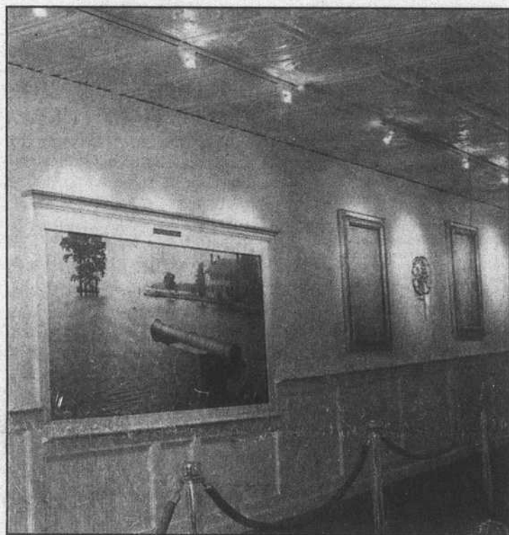
Staff photos of Taylor Theatre by Earline White

The detailed new look of Taylor Theatre will be open to viewing, as well as movie showings, on September 10.