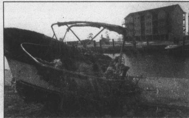
Two area teens were arrested following a weekend of vandalism that included burning a boat at Wharf Landing.