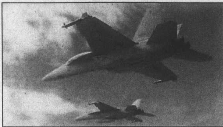
The Navy's F-18 Super Hornets are at the heart of an ongoing legal dispute between the military and Washington County residents over a proposed Outlying Landing Field.