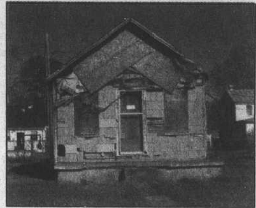
Vacant, run-down houses in Edenton are being considered nuisances by the town. They will either have to be repaired or demolished.