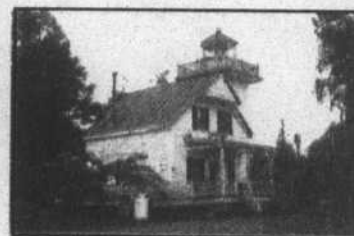
Roanoke River Lighthouse

Those who enjoy the beauty of Edenton's downtown water-