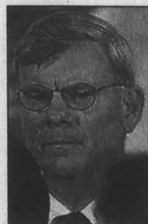
Judge Terrence Boyle