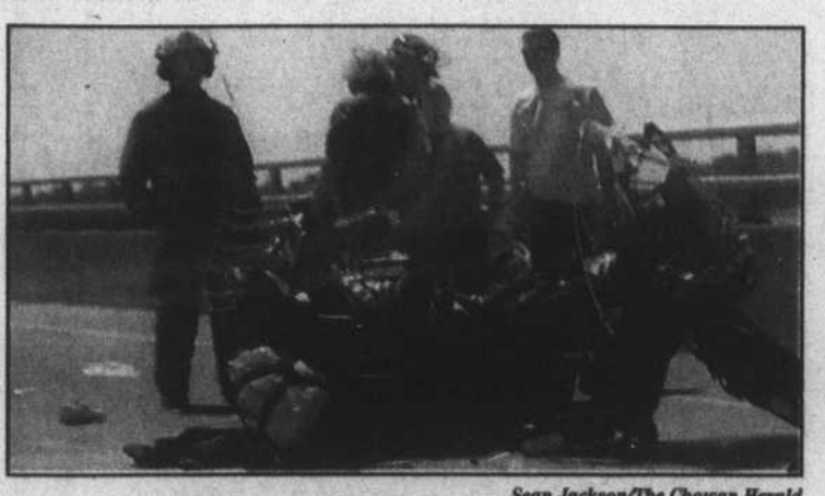
Traffic on the Chowan River Bridge was affected Friday by a motorcycle wreck resulting from a blown-out tire.

rear tire of Butler's motor- had been travelling in the See WRECK On Page A2