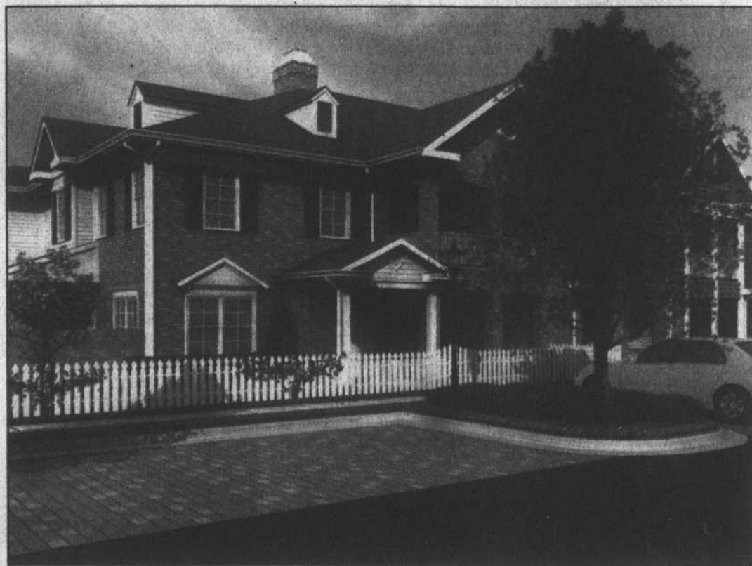
An artist's rendering of the Beechwood Square condo villas illustrate possible home sites.