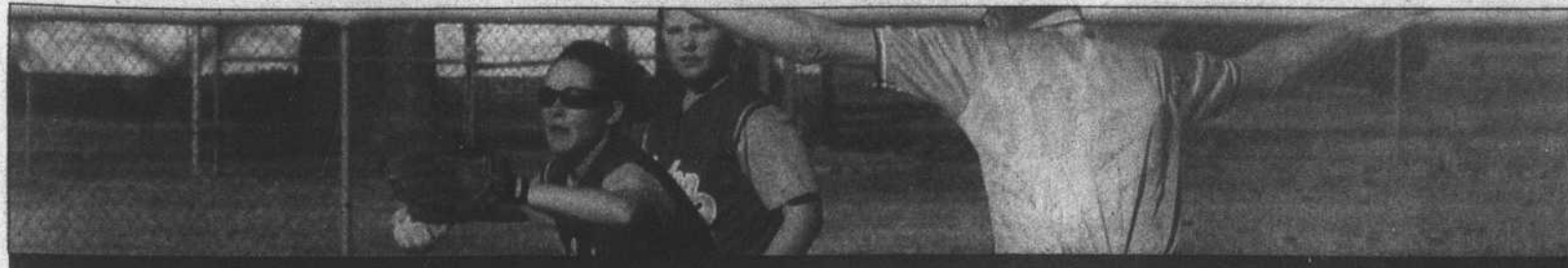
JAH SOFTBALL TEAM 4-0. BASEBALL STAR OFFERED SCHOLARSHIP. A7