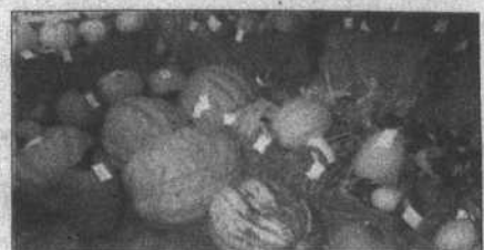
Chowan County Fair gets under way B1 50¢