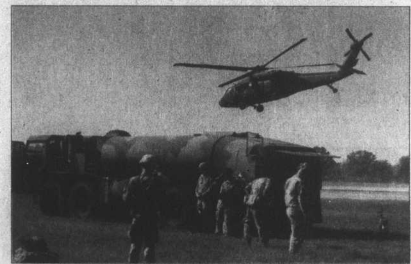
A UH-60 Blackhawk helicopter takes off after being fueled by N.C. National Guardsman from the 690 BSB Alpha Co.during a fueling training mission at the Northeastern Regional airport, Friday.

"You train to do something, then you get an opportunity to do it makes it all worthwhile," said