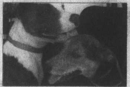
Groups curb animal euthanasia, Page 1B