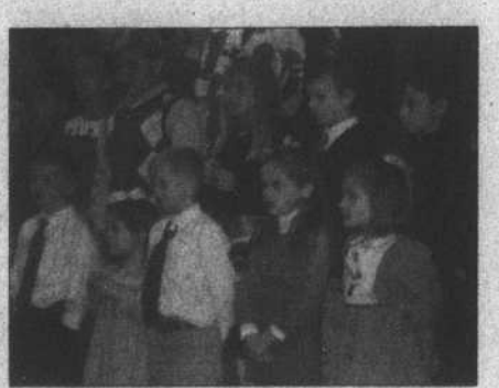
Edenton welcomes the Christmas season, 1B