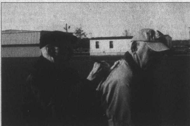
U.S. Air Force Retired Col. Gail Halvorsen signs an autograph Monday at Edenton's Northeastern Regional Airport. Halvorsen, better known as the original Candy Bomber, after he first began dropping candy to children during the Berlin Airlift.