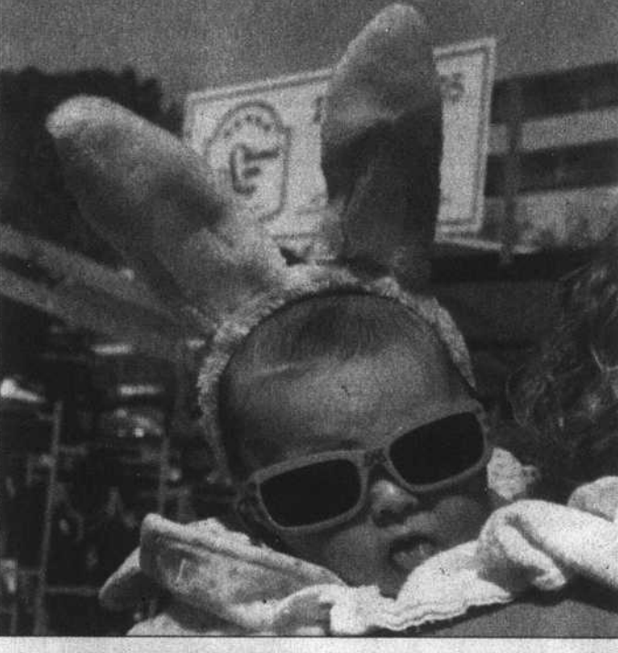
HUNTIN' for EASTER