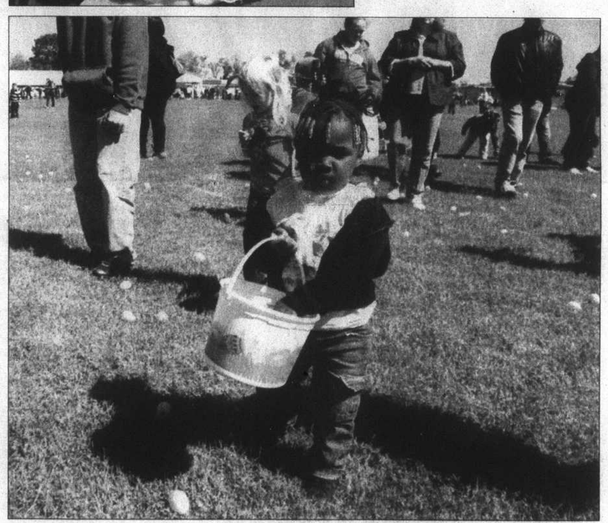
Some 25,000 eggs were scattered about the American Legion Fairgrounds for Open Door Church's Easter Egg Hunt, Saturday. As many as 1,300 participated in the festivities. For more photos of the event, see Page 6B.