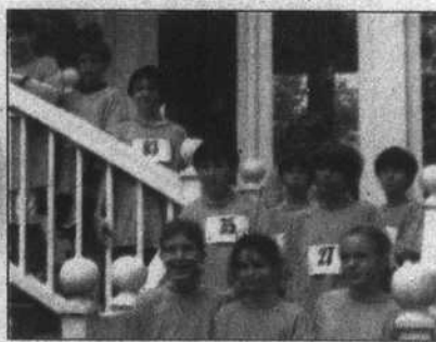
Rec kids run 5k, 6A