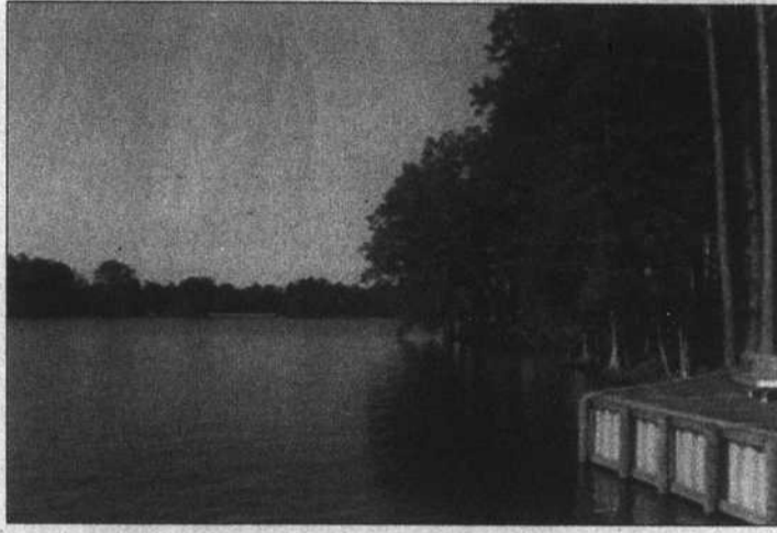
River Sound provides a bulkhead along Yeopim River.