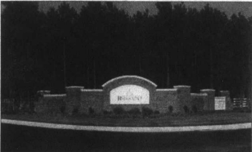
River Sound is a gated community that pre-sold 225 lots in 2007.

Chowan County has ordered that International Fidelity Insurance Company (IFIC) fulfill its bond obligation and finish what the Waterfront Group started in 2007. Over the course of a weekend that year Waterfront sold all of the lots in River Sound's phase I. Those who purchased property at optimum