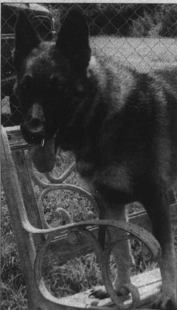
Shakira is a young female German shepherd with a great personality.