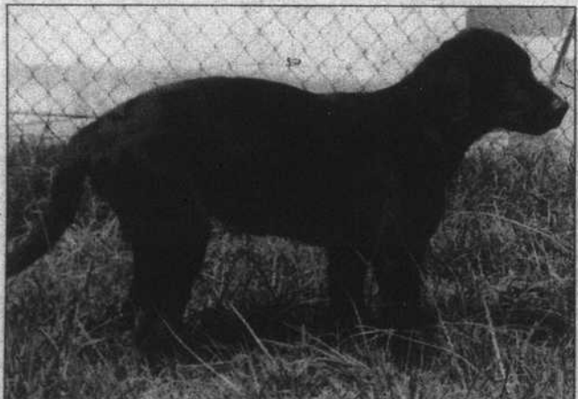
Spunky is a 3-4 month old black Lab puppy. She is a happy little girl that is ready to be trained to do all sorts of tricks.