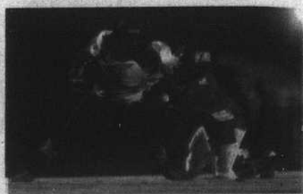
Bye week helps Aces — 6B