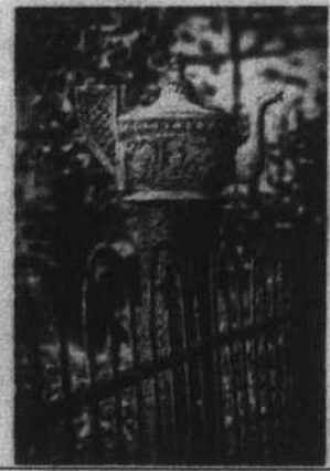
Photog depicts town in black & white — 1B 50¢