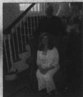
Priest, wife say 'so long' to town, parish — 6B