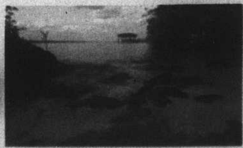
'Marine kudzu' threatens river — 4A