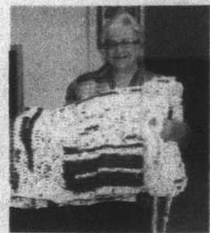
Project raising awareness of homeless vets — 8B