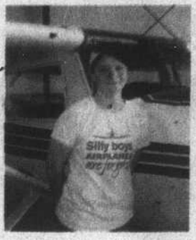
Teen pilot to help with flights for youth — 1B

P8/C8*****CAR-RT LOT**C 002 A0092 SHEPHERD PRUDEN LIBRARY 106 W WATER ST EDENTON NC 27932-1854