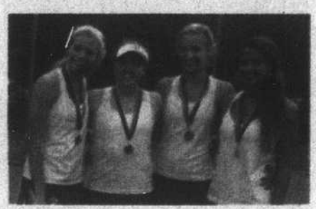
Lady Aces doubles teams top 2A East Regional — 6A 50¢