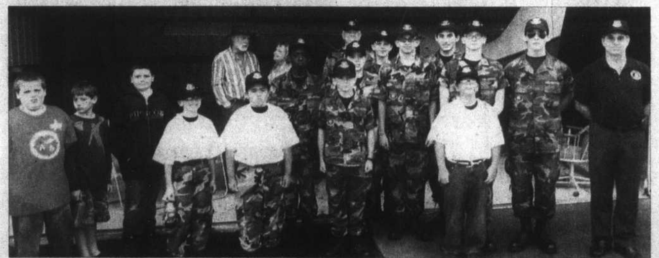
These young men were among the hardy souls who braved rain on Saturday to view vintage airplanes and vintage cars at the Northeastern Regional Airport. The Wings Over Edenton event was cancelled due to weather, but folks at the airport still welcomed visitors and gave them an opportunity to see the old planes and old cars.