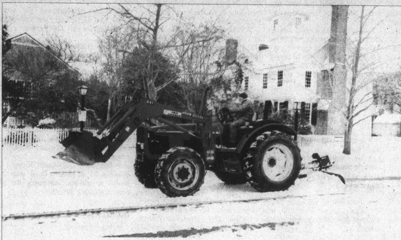
The Cupola House can be seen in the background as snow is being cleared from South Broad Street after a recent snowfall.

Major highways in Chowan County were clear as of