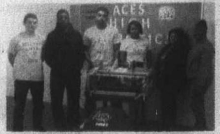
Robotics Club builds robot, enters contest — 7A 50¢

SHEPHERD PRUDEN LIBRARY 106 W WATER ST EDENTON NC 27932-1854