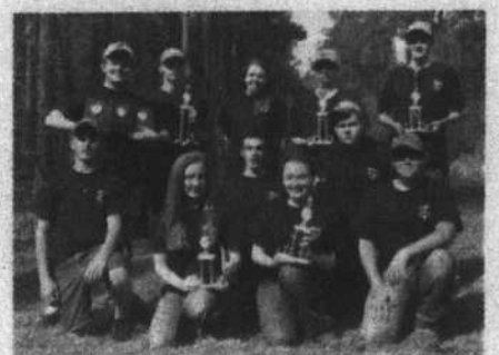
Hunter safety team has big day — 6A 50¢

PS/CB*****CAR-RT LOT**C 002 A0095 SHEPHERD PRUDEN LIBRARY 106 W WATER ST EDENTON NC 27932-1854