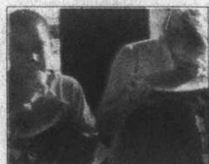
July 4th festivities planned, 1B