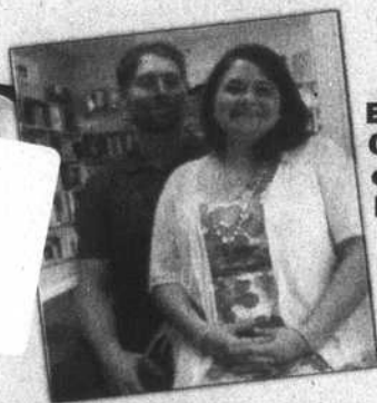
Berrys buying Garden of Readin' bookstore, 5A

P8/C8*****CAR-RT LOT**C 002 A0109 SHEPHERD PRUDEN LIBRARY 106 W WATER ST EDENTON NC 27932-1854