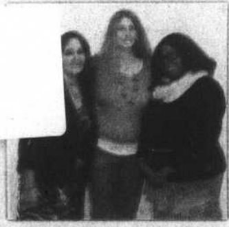
Conference urges women to take care of themselves — 6B

PB/C8*****CAR-RT LOT**C 002 A0109 SHEPHERD PRUDEN LIBRARY 106 W WATER ST EDENTON NC 27932-1854