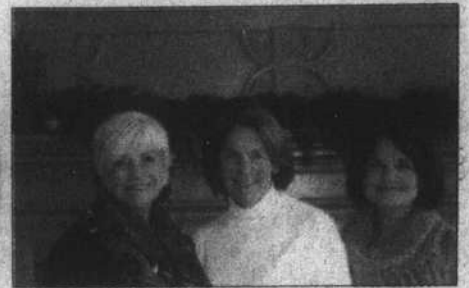
Garden Club decorates for tour — 1B

P8/CB*****CAR-RT LOT**C 002 A0109 SHEPHERD PRUDEN LIBRARY 106 W WATER ST EDENTON NC 27932-1854