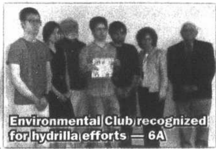
Environmental Club recognized for hydrilla efforts — 6A