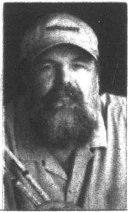
'Musicians for Martin' Aug. 29 to benefit Parker — 1B

P8/C8*****CAR-RT LOT**C 002 AC111 SHEPHERD PRUDEN LIBRARY 106 W WATER ST EDENTON NC 27932-1854