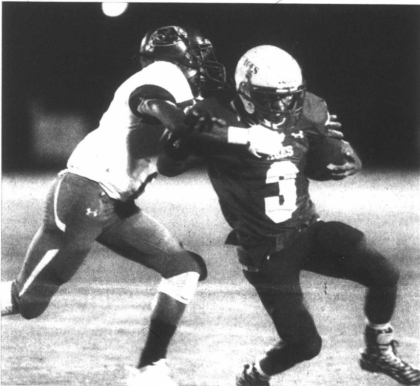
Edenton defeated Pasquotank 50-22 on the Aces' Homecoming night. See story page 7A.