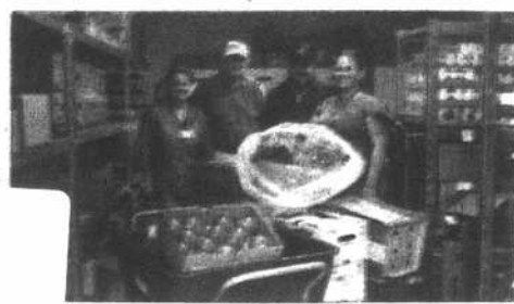
AL GROUPS COMING TOGETHER FEED FAMILIES — 1B