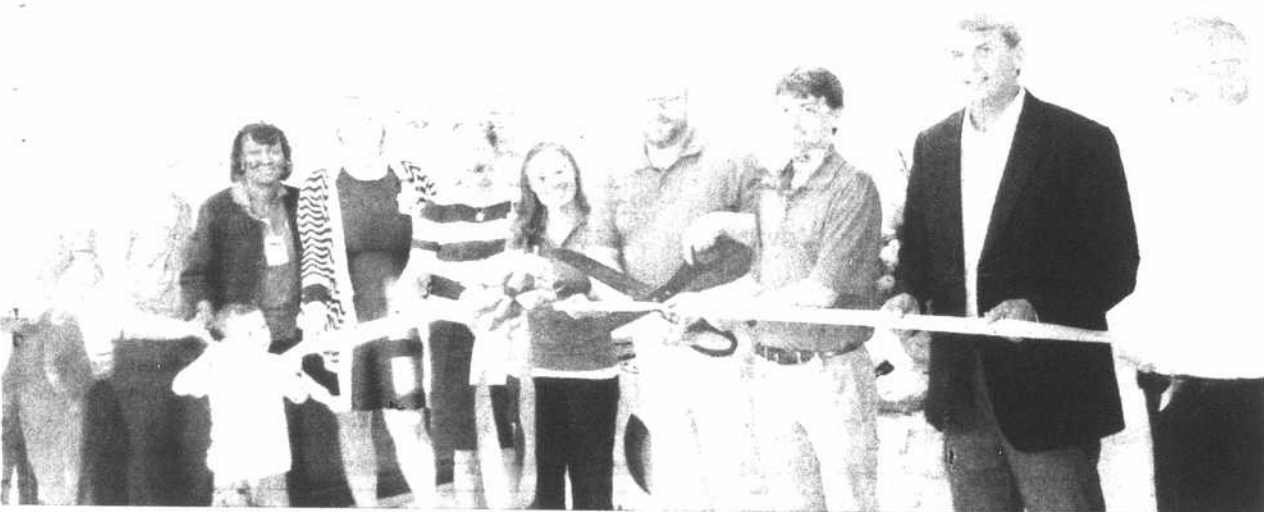
EDENTON-CHOWAN CHAMBER OF COMMERCE