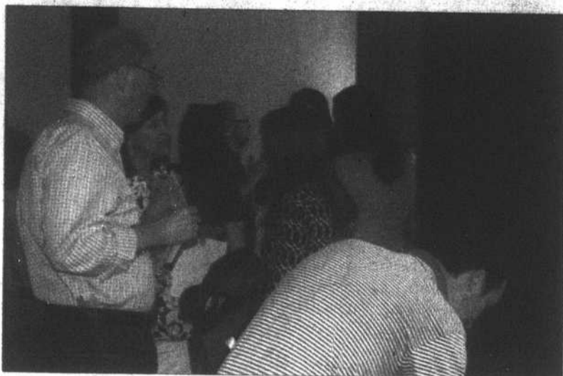
Citizens attending the Progress Edenton meeting held at the 1767 Chowan Courthouse on April 19 talk and sign in while waiting for the program to get started.