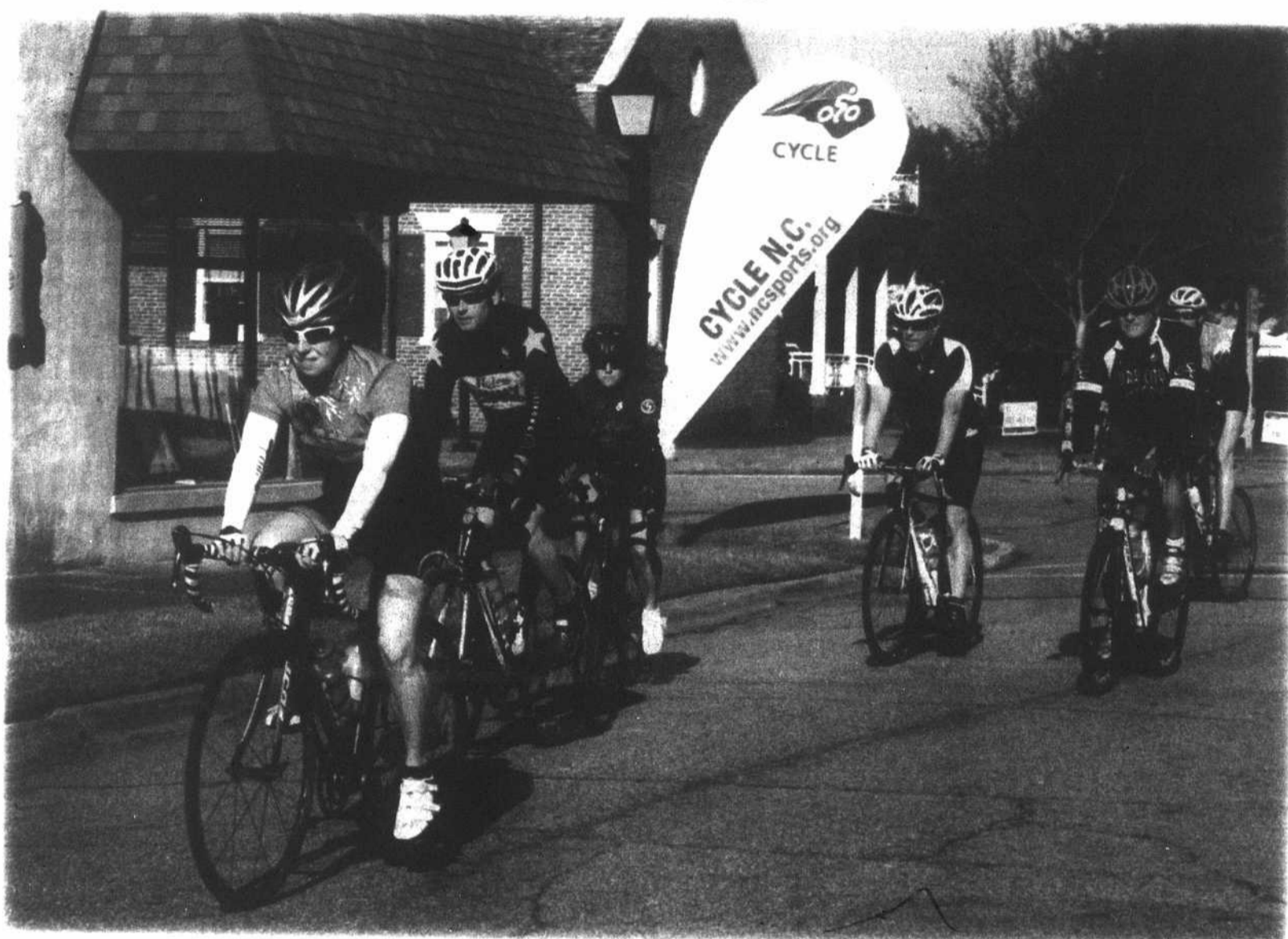
Cycle NC riders began their Sunday morning with the final ride they would make during the spring coastal ride in Edenton. They will return again in three years after doing their next spring coastal rides in other communities. See Cycle NC story on 1B.